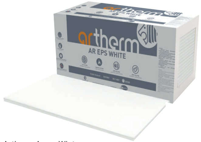
Artherm Areps White Expanded Polystyrene Rigid Foam (White)