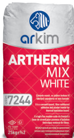
7244 Arkim Artherm Mix White It is a cement-based, fiber reinforced adhesive and plaster mortar for thermal insulation board.