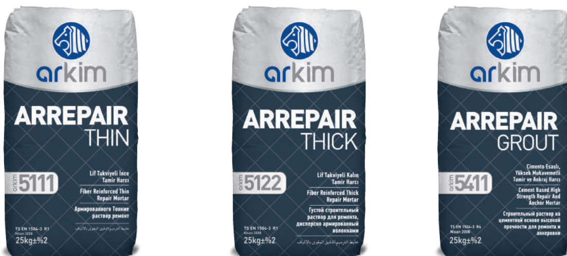
5111 Arkim Arrepair Thin Cement-based thin repair and leveling mortar.

There are cement-based repair mortars that provide high performance and strength for the repair of damages caused by chemical, physical and mechanical deterioration of buildings.