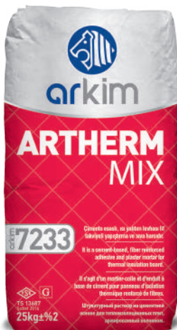
7233 Arkim Artherm Mix It is a cement-based, fiber reinforced adhesive and plaster mortar for thermal insulation board.