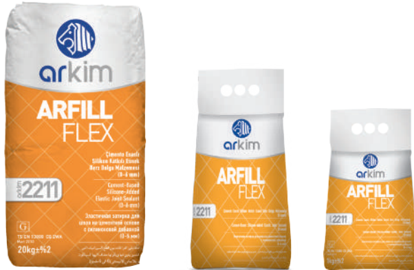
2211 Arkim Arfill Flex Cement-based, silicone-added joint filler that contributes to waterproofing

There are cement-based, silicon-added, highly water-repellent, and highly abrasive resistant joint fillers in desired colors.