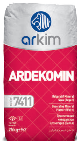
7411 Arkim Ardekomин Thick Cement-based, decorative mineral plaster