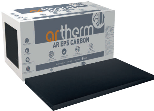
Artherm Areps Carbon Expanded Polystyrene Rigid Foam (Carbonized)