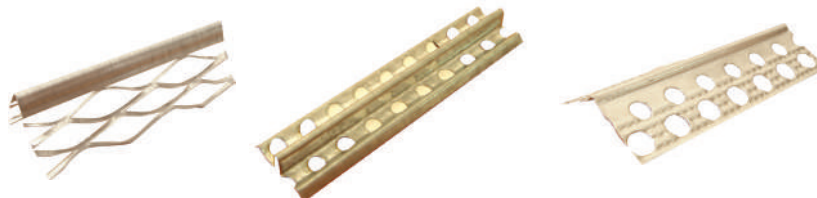
Argips Plaster Profiles

It is a highly flexible bonding plaster with high bonding strength that binds plasterboards on the surfaces like concrete, gas concrete, and brick, and thus provides flexible and decorative visuality.