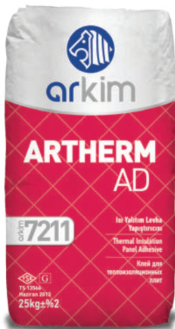
7211 Arkim Artherm Ad Cement-based, thermal insulation adhesive mortar