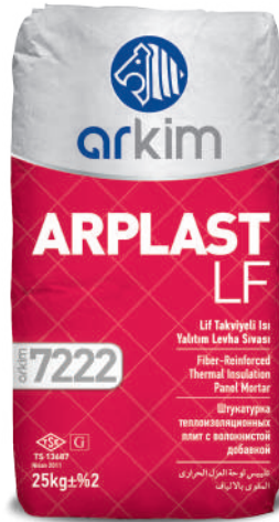
7222 Arkim Arplast Lf Cement- based, fiber-reinforced thermal insulation board plaster mortar