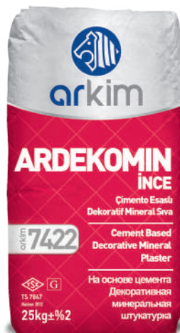
7422 Arkim Ardekomин Thin Cement-based, decorative, thin mineral plaster