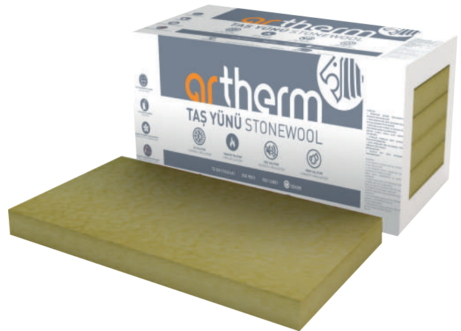
Artherm Stonewool Stonewool insulation material