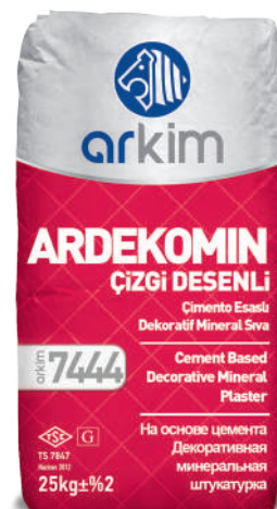
7444 Arkim Ardekomин Line Patterned Cement-based, decorative, line patterned mineral plaster